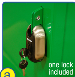
one lock included