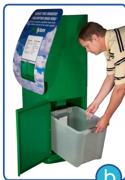
full color background graphic